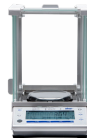
mG-S322 Precision POS Scale

This scale is perfect for creating cohesive operations by linking to the POS system via Bluetooth or serial connectivity and integrating easily with Star SDK. This NTEP and Measurement Canada-certified scale has Class III accuracy, making it trade-legal and ideal for any sector of the retail industry selling items by weight.