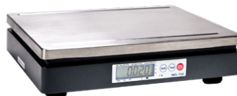
mG-T Series POS Scales

Certified scales integrate with the POS system and printers to weigh and calculate prices for deli, bulk foods, produce, or other items sold by weight. Leading scales feature a small footprint and eliminate manual data entry.