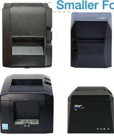
TSP654SK TSP143IV SK